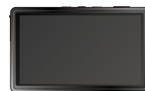
• Portable DVR PV-500EVO2 PV-1000Touch5

*Specifications are subject to change without prior notice. CE/FCC Certified